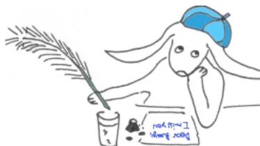
Fig. 1.2. Take notes.

you, the student, are responsible of your own success!